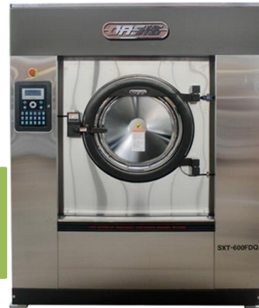
SXT-400FD/ZQ SXT-600FD/ZQ SXT-800FD/ZQ